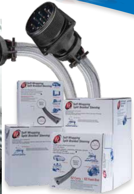
F6 is available in self-dispensing boxes.